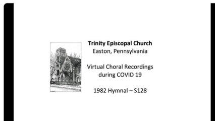
William Mathias Sanctus